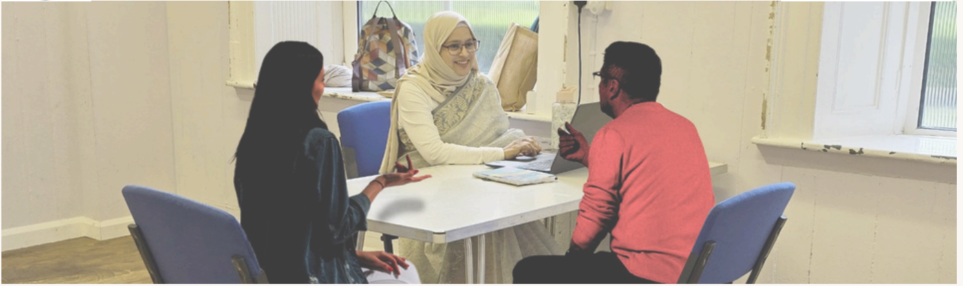
This is a computer-generated representation of the Drop-In Support Service session